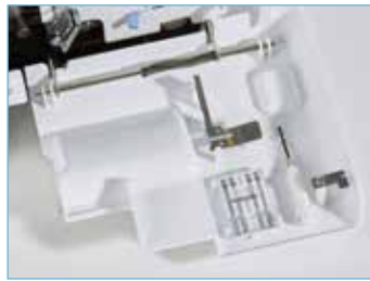
Built-in accessory storage