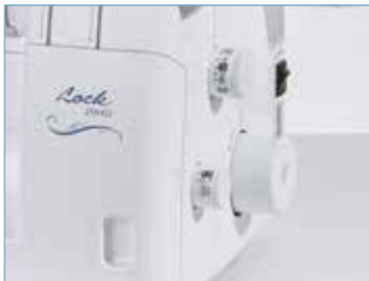
Easy access controls