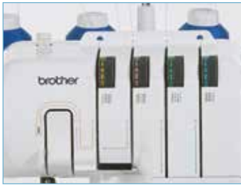
4 colour easy threading guide