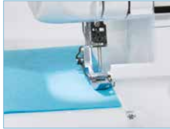
LED work light