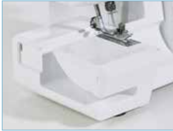
Free arm / Flat bed convertible sewing surface