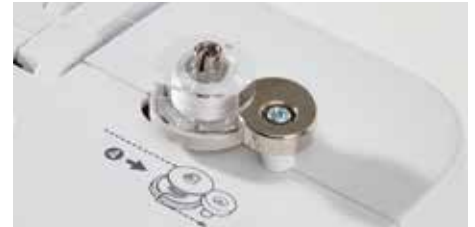
Bobbin winding system