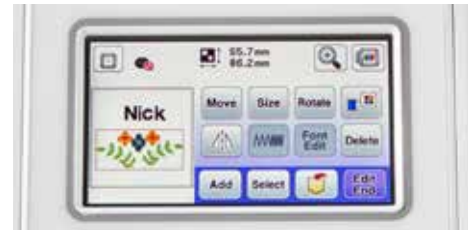
Combine embroidery patterns