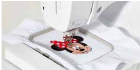
100 x 100 mm embroidery area