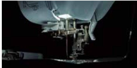
Super Bright LED Light