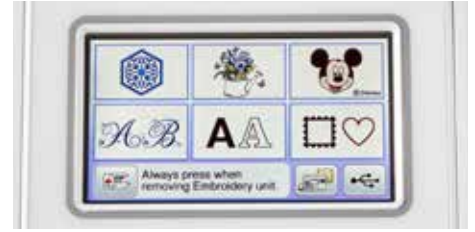
LCD touch screen