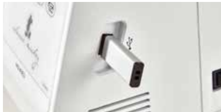
USB Port to import designs