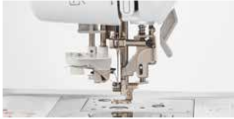
Advanced needle threading system

Here are just some of the easy-to-use functions: