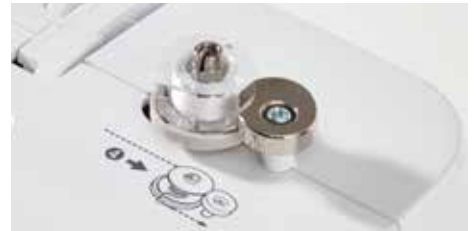
Bobbin winding system