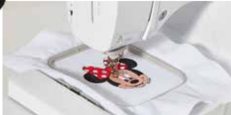
100 x 100 mm embroidery area