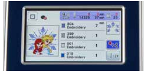
Colour LCD touch screen