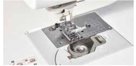
7 Point Feed